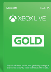
14 DAY XBOX LIVE GOLD TRIAL