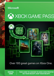
1 MONTH XBOX GAME PASS