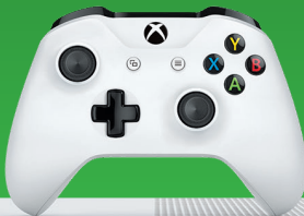
XBOX ONE S 1TB CONSOLE