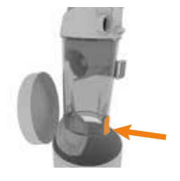
Press the dirt release clip, allowing dirt/debris to fall out.

Don't over fill the dirt container to avoid blocking the air flow through the vacuum cleaner.