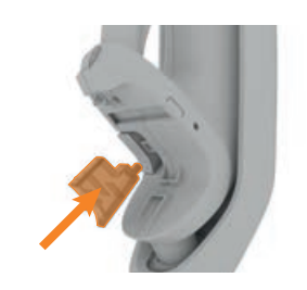
Before replacing the tank make sure the hard water filter which is located behind the tank is in place.