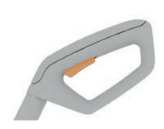
To produce steam squeeze the trigger in short bursts. Don't hold the trigger continuously to prevent over wetting floors.