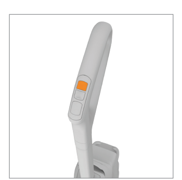
Press the on/off button to switch the machine on. The machine will always start in High Mode.