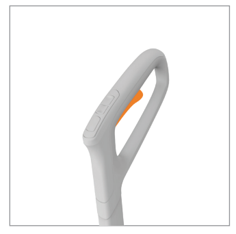
Press the trigger to release water onto the brushroll. Release the trigger at regular intervals to remove the brushroll dirt and debris. Repeat the process until the brushroll is clear and clean.