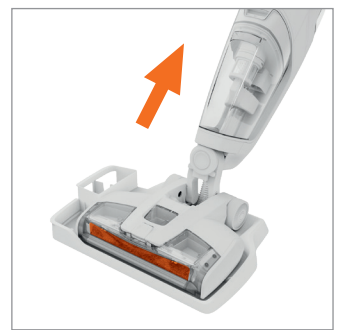
Recline the machine so that the brushes rotate.