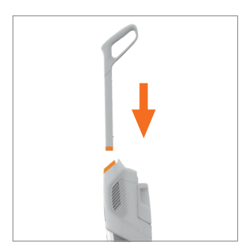
Push the handle into the main body until it clicks into place.