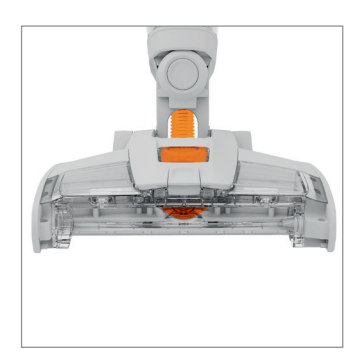
Check for blockages and use a blunt object to remove the blockage.