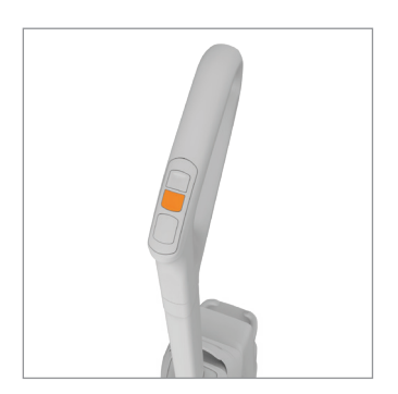
For an improved runtime, press the mode selector button to switch to Eco Mode.

For a more intense clean, press the mode selector button to switch to High Mode.