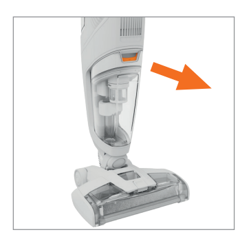
Press down the dirty water tank release button and pull the tank to remove.

IMPORTANT: Empty and rinse out the water/solution tank and dirty water tank and leave to air dry before refitting.