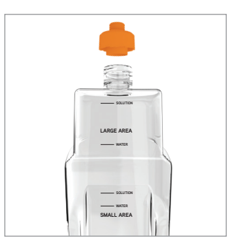
Unscrew the cap and fill to the desired level using the markers on the tank.