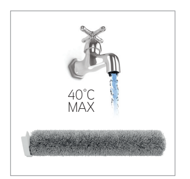
Rinse the brushroll in water (40 ^{\circ} max) and allow to dry before refitting.