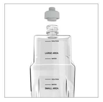
Fill the tank up with warm water (40° max) and replace the cap.

IMPORTANT: We recommend rinsing the machine and quick cleaning the brushroll after every use.