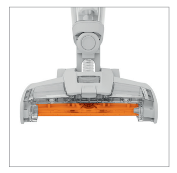
Clean the brushroll housing and brushroll cover of any dirt and debris.