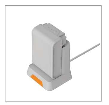
The charger light will flash white to show when the battery is charging. The light on the charger will stop flashing and go off when the battery is fully charged.