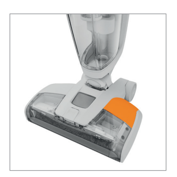
Place your foot on the base and pull the handle backwards to recline.

IMPORTANT: Your dirty water tank is fitted with a float. When the dirty water tank is full, or the floorhead is not in contact with the floor, the float will shut off the suction on the machine. You will be able to hear if this has happened as the motor noise on the machine will increase. Once the float is activated, check if the dirty water tank is full and empty if necessary. If the dirty water tank is not full, continue to check for blockages.