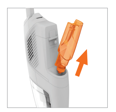
Lift to remove the water/solution tank from the back of the machine.

NOTE: When unpacking the machine, the water/solution tank cap will be attached to the side of the tank. Before first use, and after water/solution has been added, ensure that the cap is screwed onto the water/solution tank before refitting onto the machine.