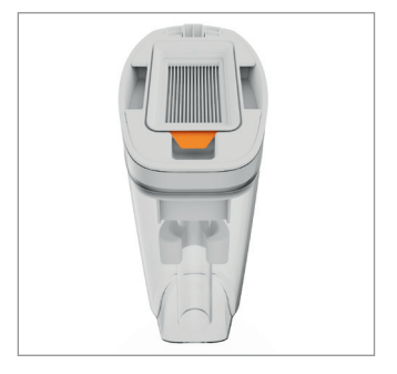
Pull the tab on the bottom of the filter to remove

IMPORTANT: After every use wash the filter with warm water (40°C max) and leave for 24 hours or until fully dry before refitting onto the machine. For best cleaning results filters should be replaced every 6 months (depending on the level of use). Ensure all filters are in place before using the machine.