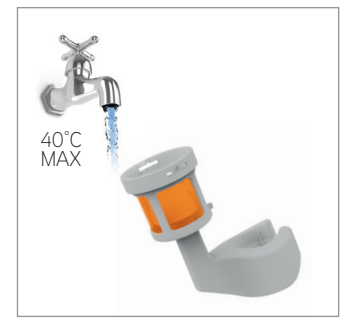
Wash the separator mesh under running water (40° max) to remove any dirt and debris