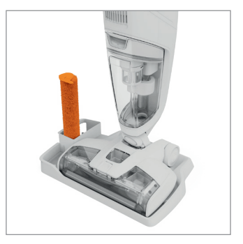
The brushroll can be dried and stored in the rinse/storage tray.