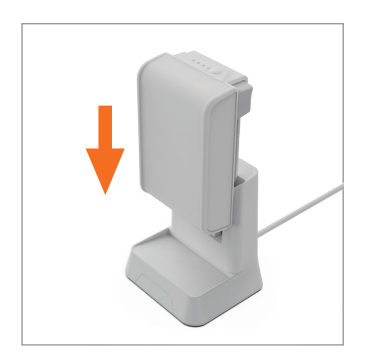
Slide the battery down on to the charger until it clicks into place.

NOTE: Before first use, ensure the battery is fully charged. Failure to fully charge the battery before first use may result in poor battery performance. The life expectancy of the battery will vary depending on the usage of the machine.