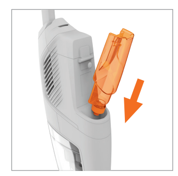
Replace the cap and push the tank down on to the machine until it clicks into place.