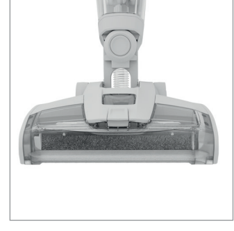
Hook the brushroll cover onto the tabs on the base and close until it clicks into place.