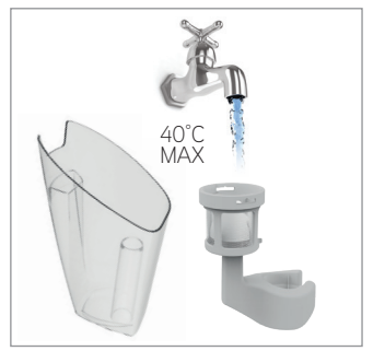
Empty the dirty water over a sink. Rinse the tank and separator under water (max 40°C) to remove dirt/debris.