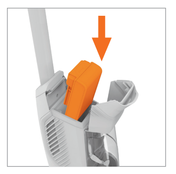
Holding the cover open, slide the battery into the machine until it clicks into place.