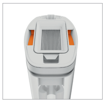
Hold the top of the dirty water tank lid and pull upwards to remove.