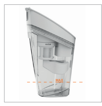
During use, regularly empty the dirty water tank ensuring the water does not exceed the max fill line marked on the side of the tank.