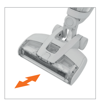
For best results apply water/solution on the forward stroke and release the trigger on the backward stroke to pick up water/solution. For a dryer finish, follow with an additional dry stoke without the trigger pressed.