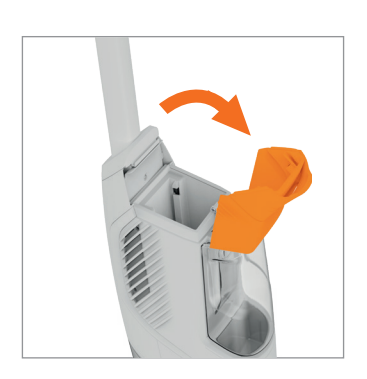
Pull to open the battery cover.