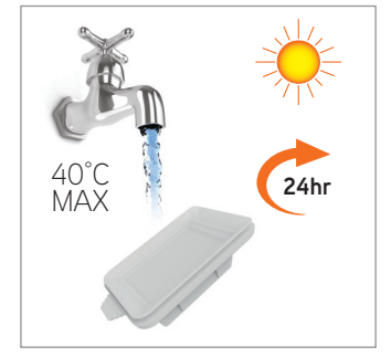
Wash the filter under running water (40°C max). Leave for at least 24hrs or until fully dry before refitting.