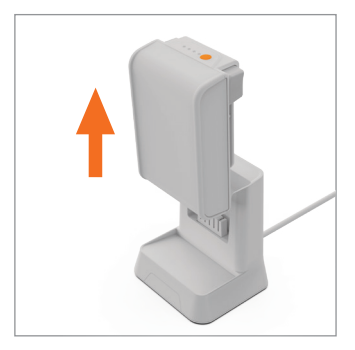
Once fully charged, slide the battery off the charger to remove.