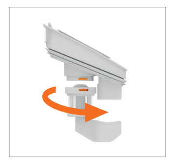
To refit, line up the separator tab with the lid tab and twist anticlockwise to lock.