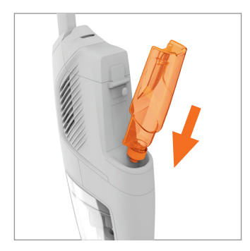
Refit the tank into the machine.