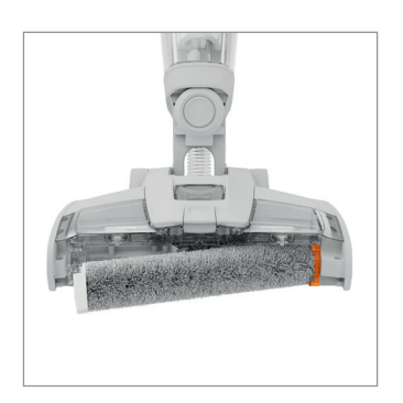
To refit the brushroll, slide the right side into the machine and then push the left side in until it clicks.