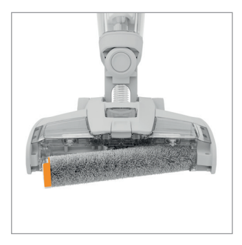
To remove the brushroll, pull the tab on the end and remove from the brushroll housing.