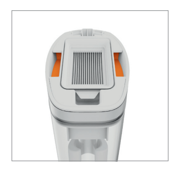
Hold the top of the dirty water tank lid and pull upwards to remove.