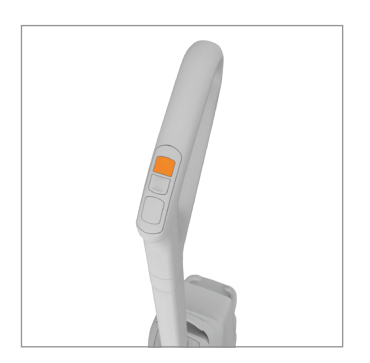
Switch the machine on.