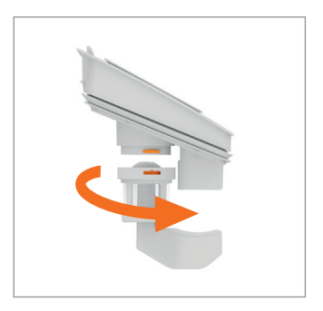
To refit, line up the separator tab with the lid tab and twist anticlockwise to lock.