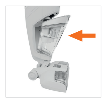
To re-fit, tilt the dirty water tank and line the front of the tank up onto machine. Push back until it clicks into place.