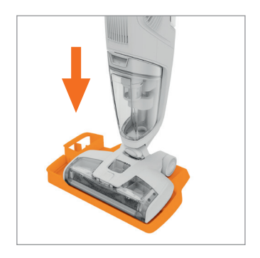
Place the machine upright in the rinse/storage tray.