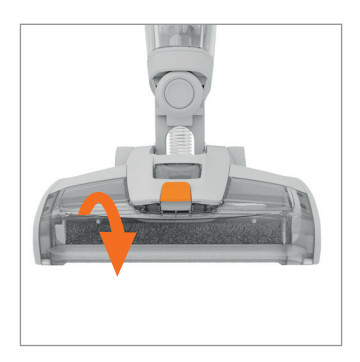
Press the brushroll cover button and pull to open the cover.

CAUTION: If the brushroll has been obstructed, the brushroll motor protection sensor may have been activated. The brushroll will stop, the light on the handle will flash white and the machine may switch off. To reset, remove the brushroll and clear any obstruction. Wait 1 minute before refitting the brushroll, switch the machine on and recline.