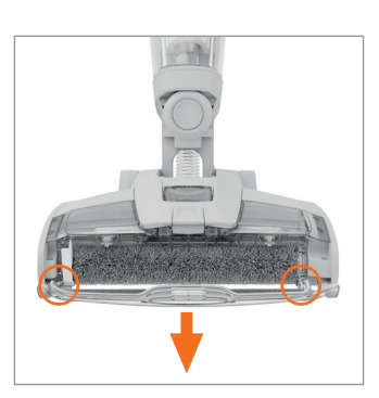
Unhook the brushroll cover and remove.