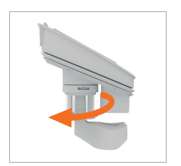
Twist the separator clockwise to release from the lid.