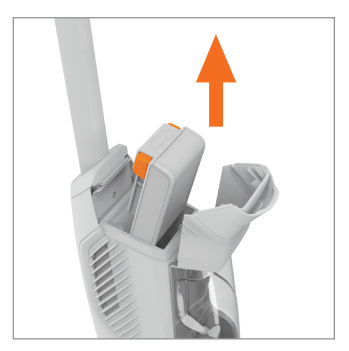
To remove the battery press both the buttons to release.