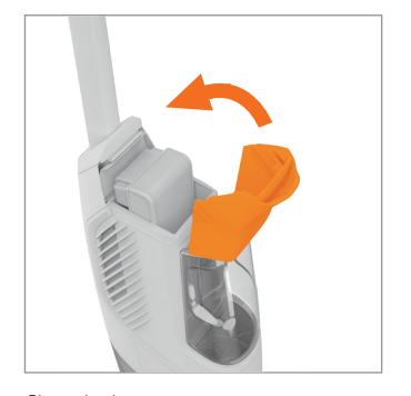
Close the battery cover.