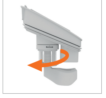
Twist the separator clockwise to release from the lid.