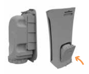
Turn the water tank so the cap is at the bottom. Line up the water tank with the machine inserting the bottom of the water tank into the machine first. Push back until water tank cover clicks into place.