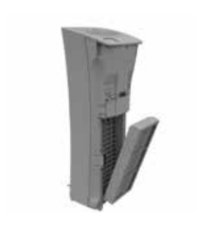
Line up and refit the new filters into the machine.