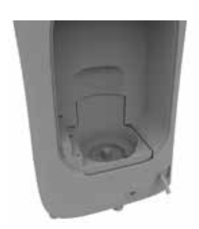
Using a dry cloth wipe the reservoir underneath where the water tank would sit.