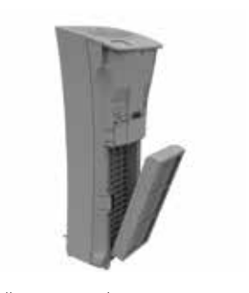
Pull to remove the filters from machine.