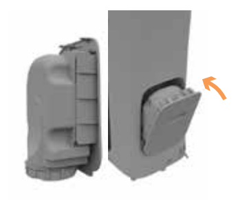
Make sure the water tank lid is tightly fitted and turn the water tank so the cap is at the bottom. Line up the water tank with the machine inserting the bottom of the water tank into the machine first. Push back until water tank cover clicks into place.