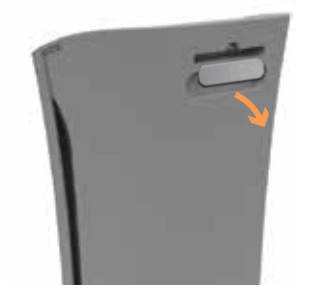
Remove the remote control stored on board at the back of the machine.