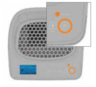
Plug the appliance into a power source and press the on button. Insert a small blunt instrument such as pen nib into the reset insert and hold down for a few seconds to reset the filter life calculator. A beep sound will be heard to confirm the filter reset has been set and the LCD screen will turn blue again.