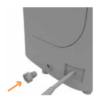
Push the drainage cap back into place, making sure it is correctly fitted.