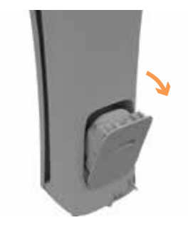
Turn off and unplug the unit. Press the water tank release button and pull to remove.