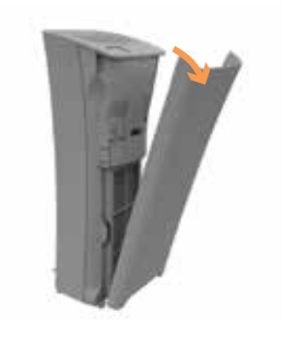
Turn off and unplug the unit. Pull either side of the front cover to remove.

The filter life bars on the display panel will decrease gradually throughout the use of the machine. When the filters need replacing the life bars will flash and the display panel will turn red.