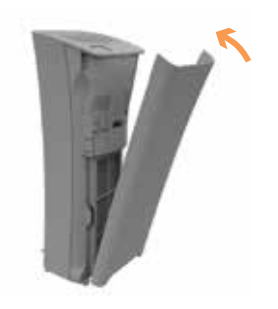
Line up tabs on the bottom of the filter, cover with the tabs on the machine. In a hinge like manner push the cover until it clicks into place.