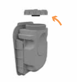
Twist the water tank cap anti-clockwise and remove. Empty over a sink and rinse tank.