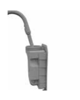
Fill the water tank with water to the max fill line. To prevent build up of limescale especially in hard water areas, filtered water is recommended. Do not add any fragrances or scented oils to the water tank.