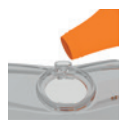
Pour 30ml of Vax detergent and 90ml of water into the detergent tank.