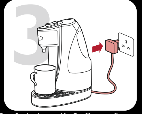
Step 3: plug in your HotCup™ water dispenser