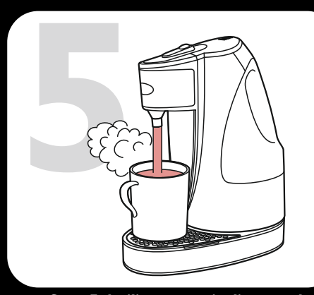
Step 5: boiling water is dispensed