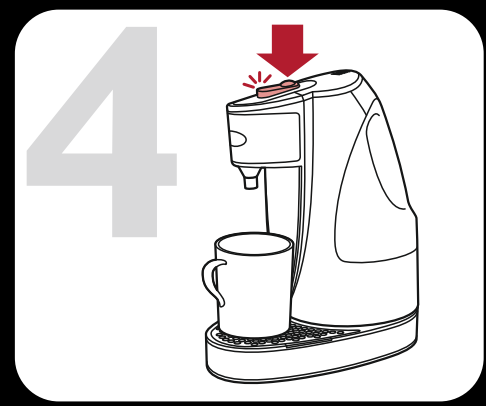
Step 4: press the on/off button until it lights