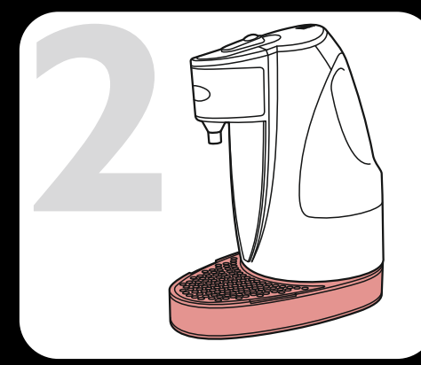
Step 2: replace on the power base