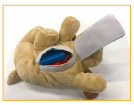
Step 3: Place the Real-Feel pulsing heartbeat into the pocket on the underside of the HuggiePup<sup>TM</sup> companion.