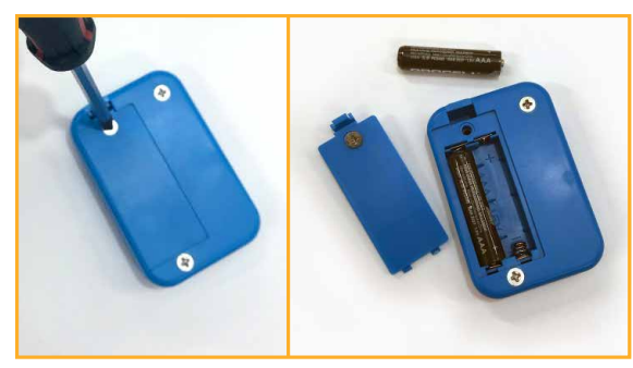
Step 1: Remove battery cover by unscrewing the battery cover screw. Install the 2 AAA batteries and screw the battery.

You will need a #2 Phillps screwdriver and 2 AAA batteries. (not included)