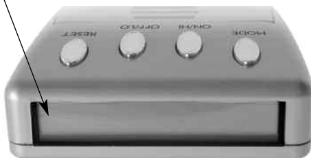
Magnetic contacts underneath