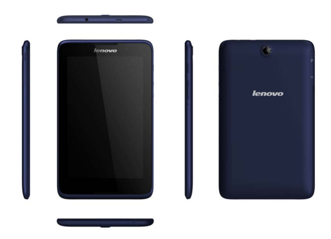
Tip: The Lenovo TAB A7 models & versions are as below: