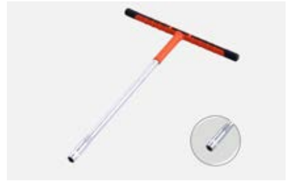
8mm Inner Hexagon Spanner