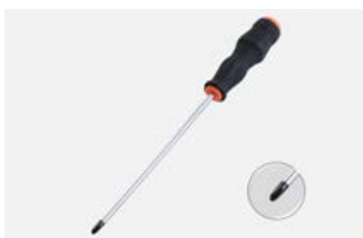
6x300 Cross-head Screw driver