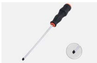
6x300 Slotted Screw Driver