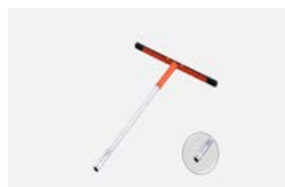
8mm Inner Hexagon Spanner