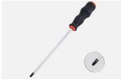
6x300 Cross-head Screw driver