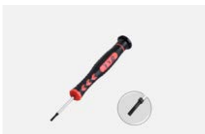
2x100 Slotted Screw Driver