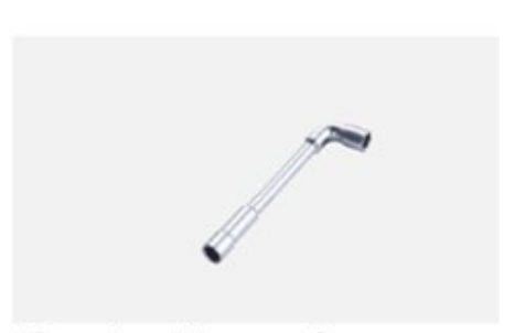
10mm Inner Hexagon Spanner