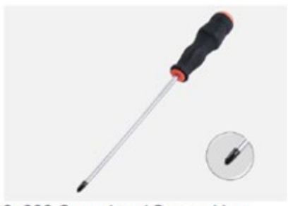
6x300 Cross-head Screw driver