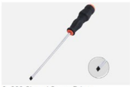
6x300 Slotted Screw Driver