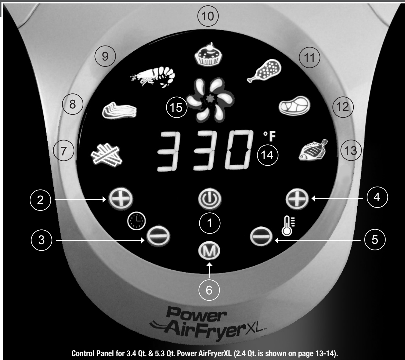
Control Panel for 3.4 Qt. & 5.3 Qt. Power AirFryerXL (2.4 Qt. is shown on page 13-14).