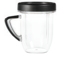
1 Short Cup with 1 Comfort Lip Ring