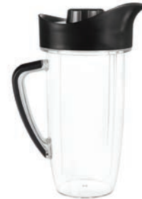
1 Oversized Cup with 1 Pitcher Lid