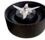
1 Extractor Blade