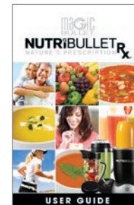
1 User Guide