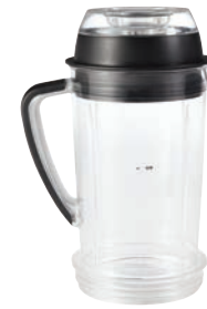
1 SouperBlast Pitcher with 2-piece Lid