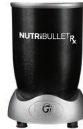
1 High-torque Power Base