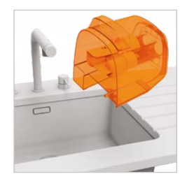
Empty the dirty water into the sink or toilet.