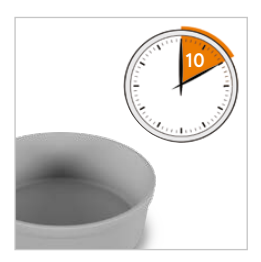
Once the bowl is empty, let the machine run for 10 seconds to remove residual water and dirt left in the hose. Repeat the process again if needed.