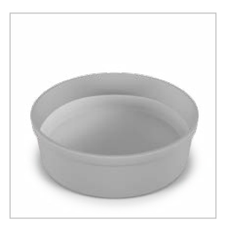
Fill a bowl with a maximum 500ml of warm water (max 40°C) (no solution).